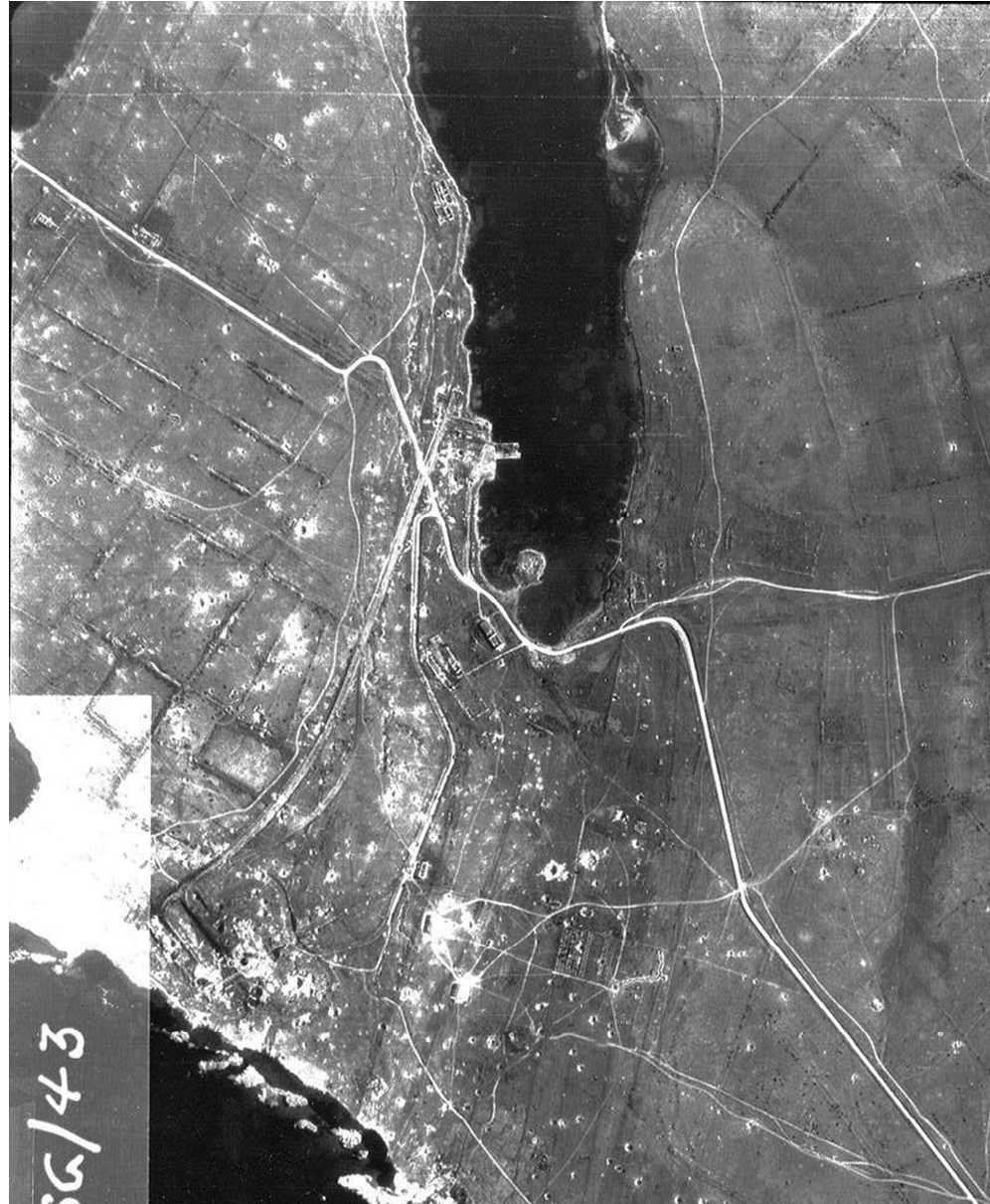
8. Southern part of the Lighthouse Peninsula. Aerial photo, 1943.