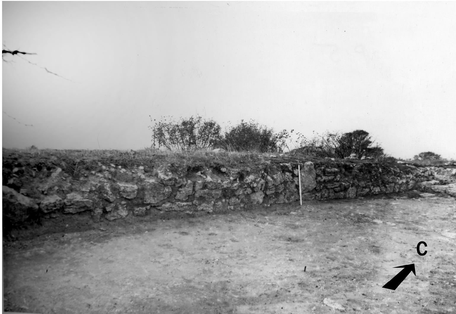
4. Western fortification wall. Internal facade. Empty space.