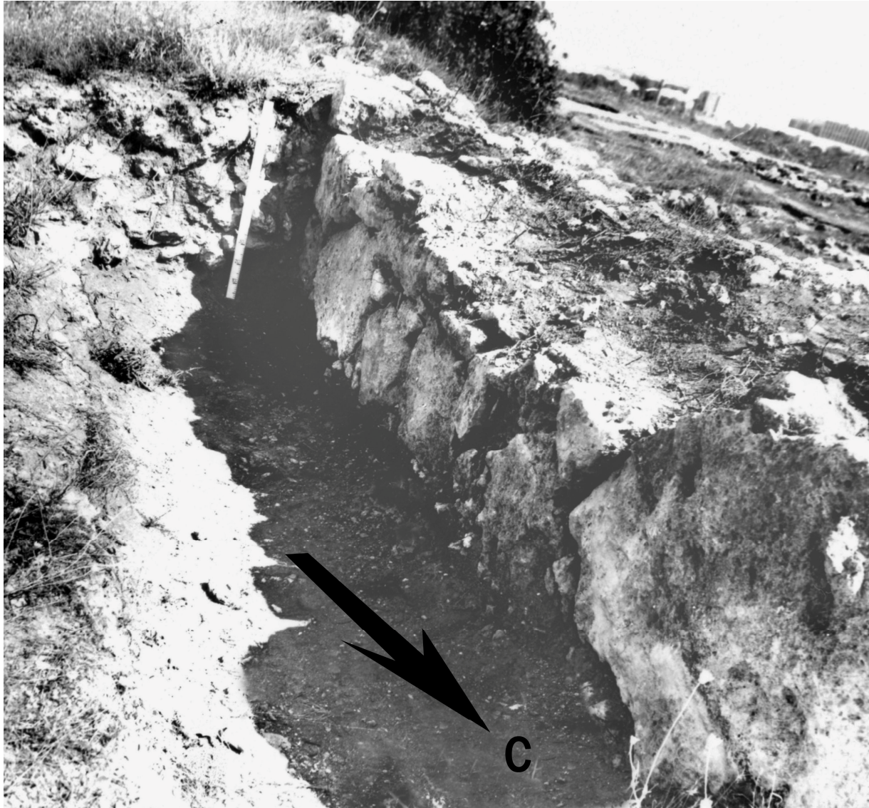
5. Western fortification wall. External facade.